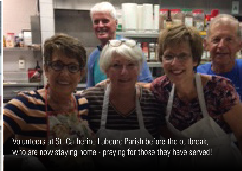
Volunteers at St. Catherine Laboure Parish before the outbreak, who are now staying home - praying for those they have served!