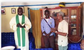
Vincentian priests and parish volunteers visit with families.

is a widow with two small children. Gladys farms a small plot of land. Her dairy cow was producing very little milk because she wasn't able to provide enough feed and clean water. She walks long distances to get water that is not polluted, as her children were becoming sick. Vincentian donors helped purchase a water tank where she can store piped