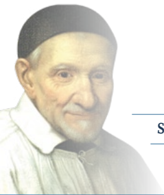
ST. VINCENT DE PAUL

3701 Forest Park Ave. St. Louis, MO 63108