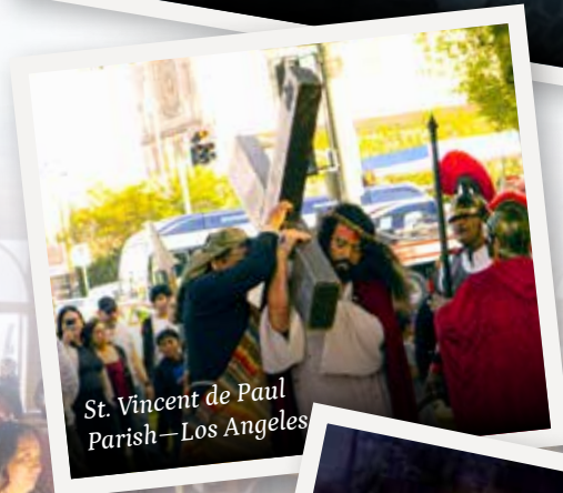
St. Vincent de Paul Parish—Los Angeles