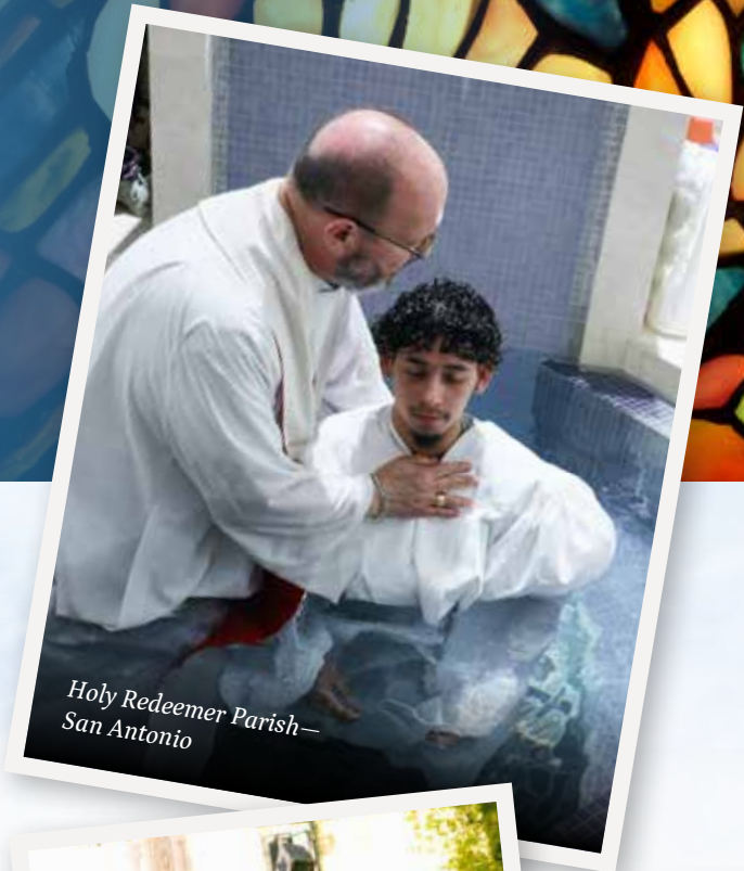
Holy Redeemer Parish— San Antonio

The presence of the faithful, gathered in celebration of Christ's resurrection, is a powerful reminder of the potency of the Vincentian mission in parishes from New Orleans to Alaska.