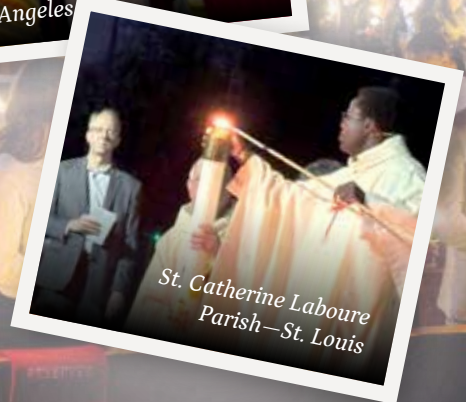
St. Catherine Laboure Parish—St. Louis