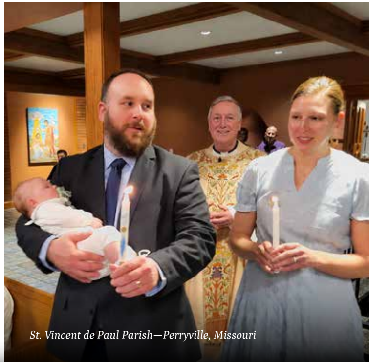
St. Vincent de Paul Parish—Perryville, Missouri