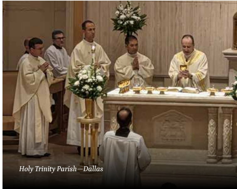
Holy Trinity Parish—Dallas