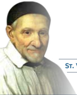
ST. VINCENT DE PAUL

3701 Forest Park Ave. St. Louis, MO 63108