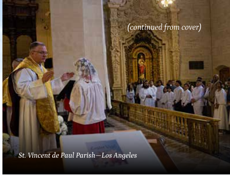
St. Vincent de Paul Parish—Los Angeles